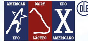
Trade fair for dairy cattle farming