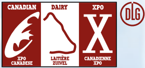
Canada's largest trade fair for dairy cattle farming